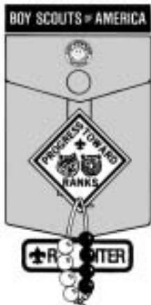
CUB SCOUT RIGHT POCKET

Conduct uniform inspections with common sense; the basic rule is neatness.