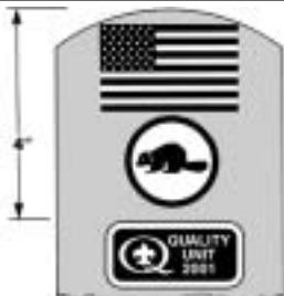
WEBELOS SCOUT RIGHT SLEEVE