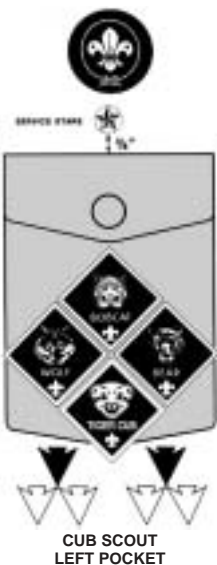
CUB SCOUT LEFT POCKET