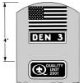
CUB SCOUT OR WEBELOS SCOUT RIGHT SLEEVE