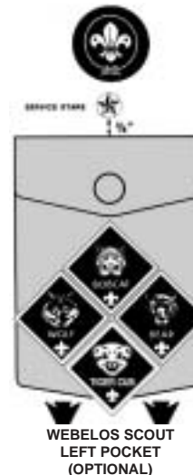
WEBELOS SCOUT LEFT POCKET (OPTIONAL)